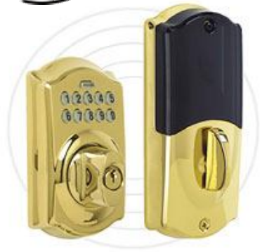
Schlage Z-Wave Lockset

Any HomeSeer system may be configured to control a Z-Wave lockset without the need for a special "bridge" unit . To do so, first, update the HomeSeer system to v2.3.0.112 (or higher). Then, install a HomeSeer Z-Troller™ or Aeon Labs Z-Stick™ Z-Wave PC interface (or other interface, based on the Zensys 5.02 firmware library). If the interface is not in direct Z-Wave range of the lockset, install a 'beaming-compatible' Z-Wave device within range of the lockset.