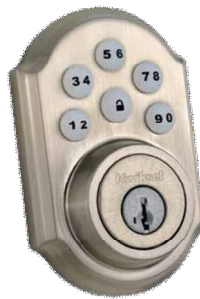
Kwikset Z-Wave Lockset